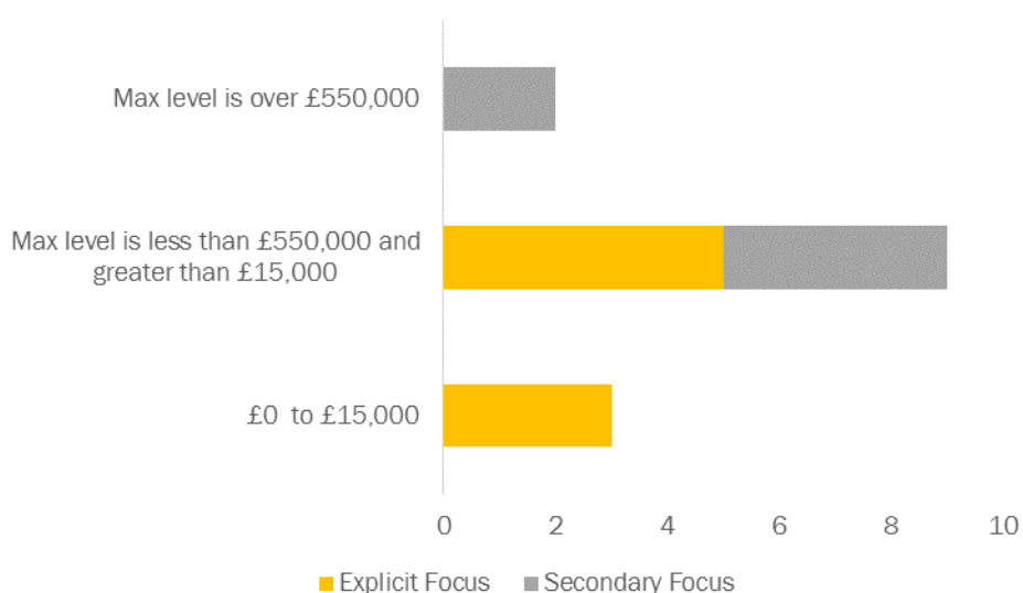
Figure 1 Grant Size Range