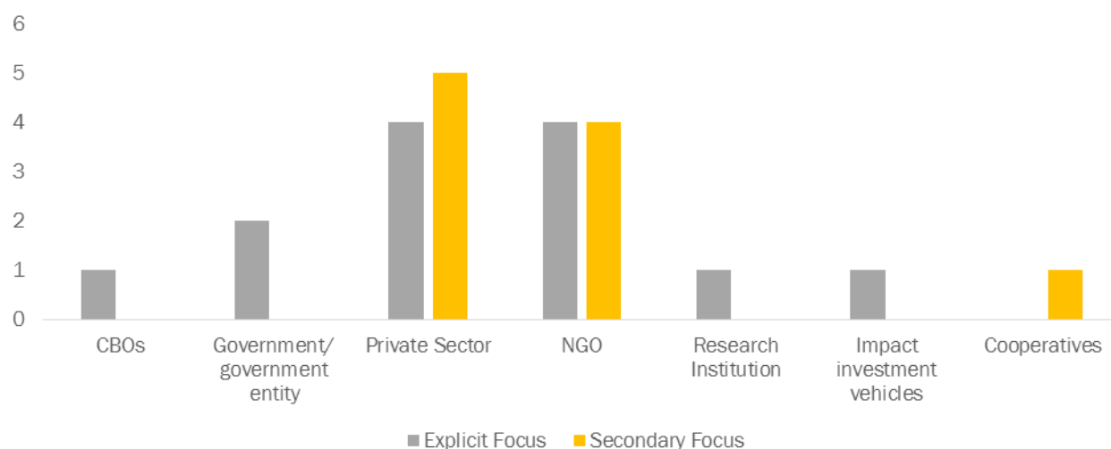
Figure 3 Eligibility