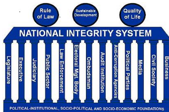
Figure 1: The National Integrity System

sector and others. The NIS consists of the principle institutions and actors that contribute to integrity, transparency and accountability in a society. These institutions constitute the pillars over which the NIS rests as depicted in Figure 1.